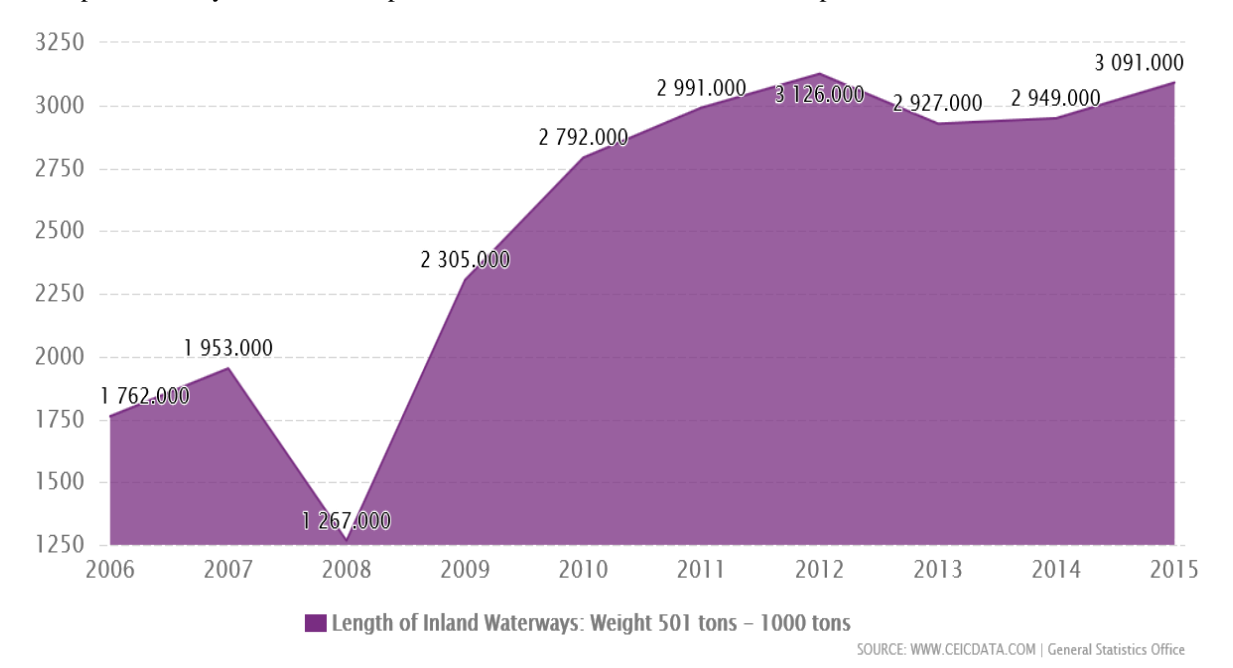
Fig.2: Inland waterway weigh in Vietnam

The interdisciplinary coordination plan to ensure inland waterway traffic order and safety in 2017 continues to be carried out under the theme of "Building Youth Transport Culture, with the goal of human life is above all." Accordingly, in 2017, the interdisciplinary 3 Department will focus on solving the outstanding and complex issues of traffic order and safety on the roads of the country, prevent the violations of law especially Means of doing business on waterways; Carry out the census of the number of inland