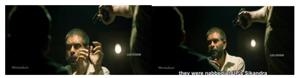
ICON 15 & 16