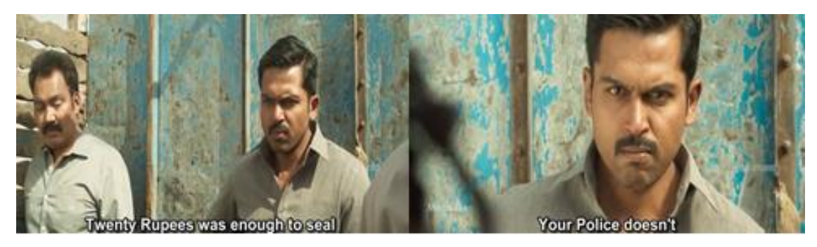
ICON 23 & 24