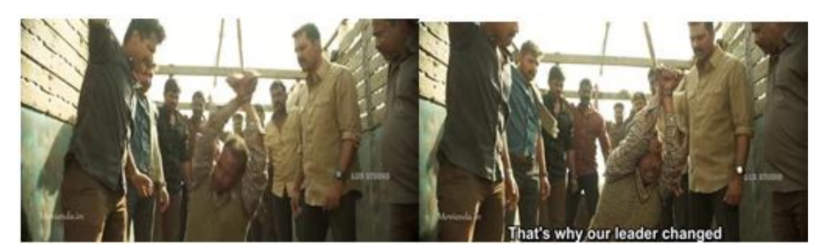
ICON 21 & 22

The last set of interrogation scenes which depict Theeran's intelligence and brilliance I SOF the accused no.9 Rukesh Singh.