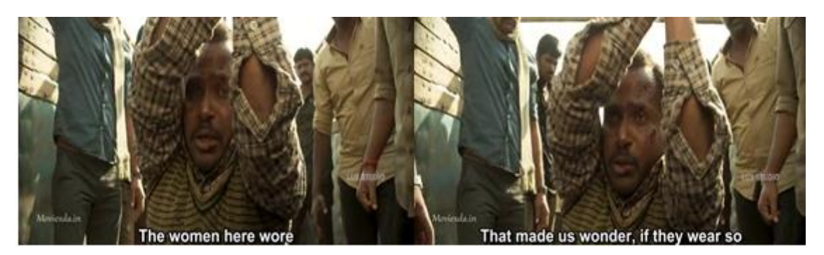
ICON 25 & 26