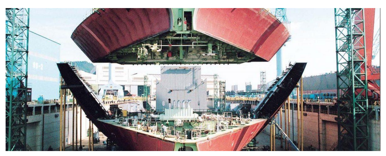
Fig. 1: Shipbuilding industry

workforce. Although there are many issues that need to be tried, but it is a young and significant workforce, so the world is very interested in Vietnam's shipbuilding industry. Shipbuilding industry is very important, first of all country case. Given the low profitability, countries in the world are required to equip the shipbuilding industry with the strength of its maritime power, in order to serve the defense of the country, especially one country. Maritime families. The characteristics of the shipbuilding industry require very high investment and low efficiency, so the role of the State is to invest a lot, so the shipbuilding market must be paid special attention to the construction of the ship. Defending the sea, creating a strong fleets for transport, travel of the people such as tourism, fishing ... and if the excess is new for export. In the past we have been planning a bit too ambitious, we want to be the world's fourth largest shipbuilder and shipbuilder in the world, and that ambition has led to failure in the past.