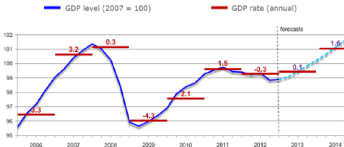
Fig.1: GDP trends in the EU: levels and rates.

Innovation Union is the European Union strategy to create an innovation-friendly environment that makes it easier for great ideas to be turned into products and services that will bring economy growth and jobs (Figure 1, Figure 2). The Annual Growth Survey for 2013 launches the 2013