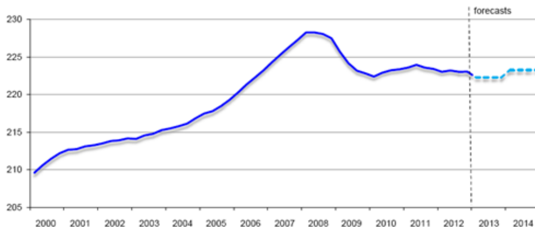
Fig. 2: Number of people employed in the EU (in million).