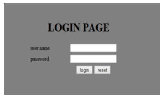
Fig .2: User Authentication

So here to prevent these attacks we are going to propose a new schema which is based on diffie Hellman. It works like in initial stage it will shows us a simple authentication with user name and password. After that Diffie-Hellman is used to encrypt data. All the proposed architecture is shown as following: