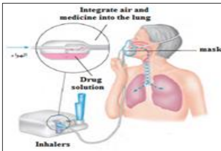
Fig. 2 How Intermediates Work

The spray inhaler is simple presser for air by liquid of drug gives a spray can be inhaled by a mask or oral device.