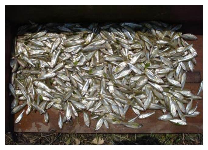
Fig.4: Fish produced in paddy cum fish culture system

It has been evidenced that introduction of the species into this system did not hamper the growth of other carps. Moreover, the fish added an additional yields in the range of 43.4 to 75.8 kg/ha, sharing 6-9 % of the total production (Fig.4). Due to their self-breeding habit, population increased 50-65 times more than the number stocked initially. Fish were harvested at regular intervals starting from the month of December-January and continued up to pre-monsoon period. Use of selective gear having desired mesh size was found very much effective to harvest relatively larger fish (2-4 g) leaving the smaller ones to grow further.