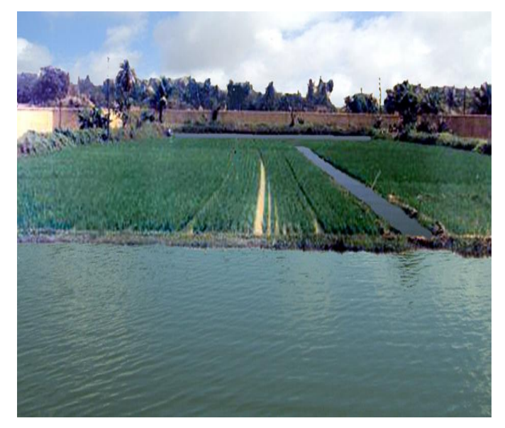
Fig.3: Mola culture pond adjacent to paddy field

Experiments were conducted in Wastewater Aquaculture Division of CIFA, Rahara since 1988 in such modified paddy plots. Prior to monsoon major carps, medium carps and A. mola were stocked in lateral ponds. The matured male and female (1:1) of A. mola were stocked @ 1000 nos/ha. With the entry of monsoon rain, the whole paddy plots and adjacent lateral ponds became a single water sheet (Fig.3). The fish migrated into paddy growing area from the adjacent ponds. The khariff paddy plants and other aquatic weeds present in the paddy plots served as a very good breeding ground wherein fish breed naturally and their spawn grew by consuming the natural food available in the paddy plots.