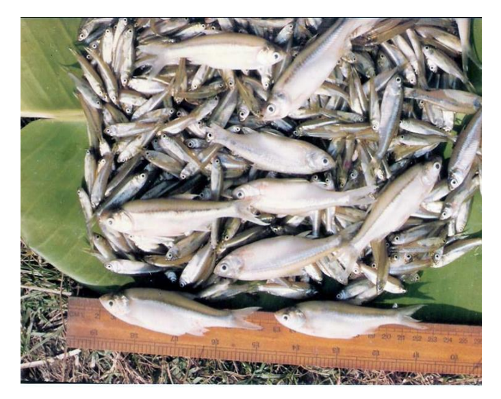
Fig.1: Amblypharyngodon mola