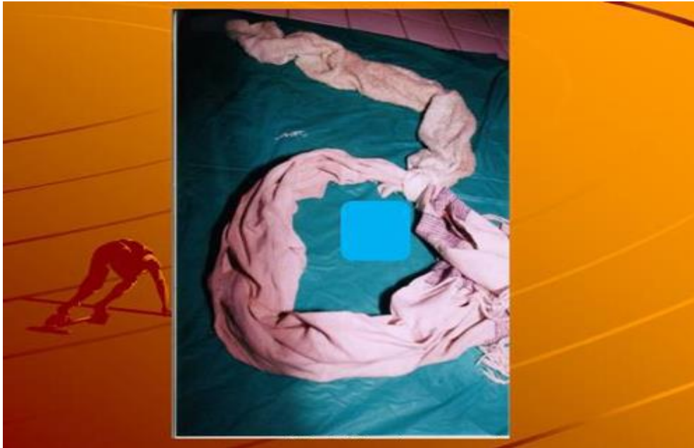
Fig. 2: Ligature used (towel).