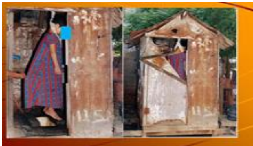
Fig, 1: The scene of completed hanging in secured place.

The scene, ligature material tied around the neck and injuries were shown in figures